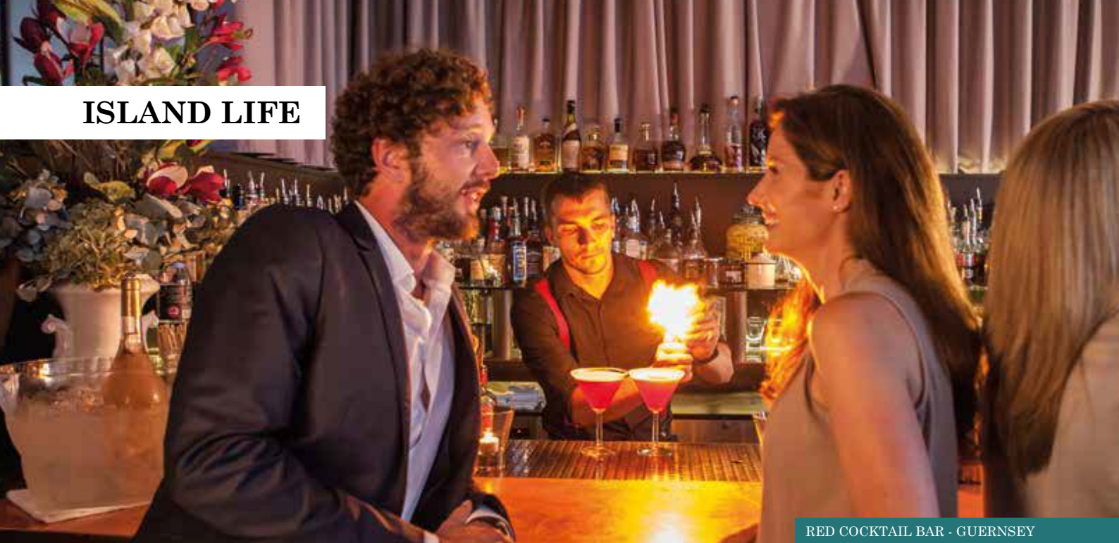
RED COCKTAIL BAR - GUERNSEY