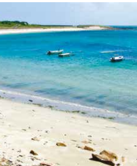
LONGIS BEACH - ALDERNEY

Once you've finished exploring Guernsey, take a trip to one of the Bailiwick's other islands; Sark, Herm, Lihou and Alderney. Just a short walk, ferry or plane ride, and perfect for getting away from it all and enjoying a daytrip, a weekend break or longer stay.