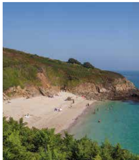
BELVOIR BAY - HERM

Get in touch with a sports club in Guernsey: www.guernseysports.com