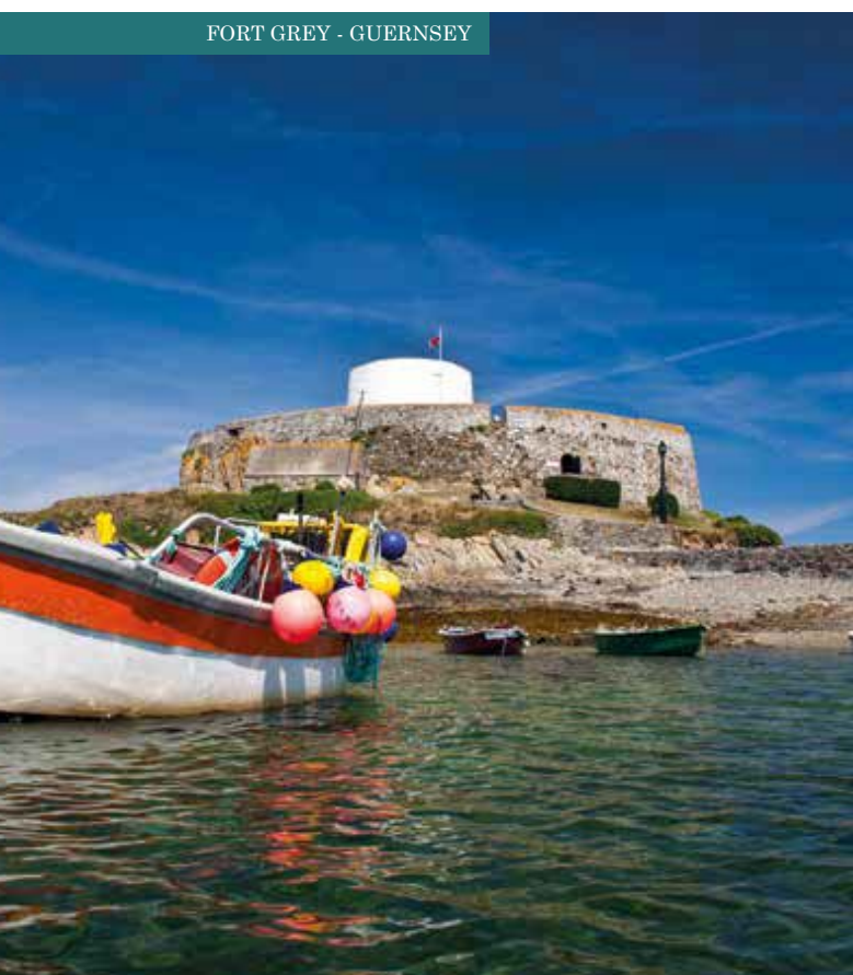
FORT GREY - GUERNSEY