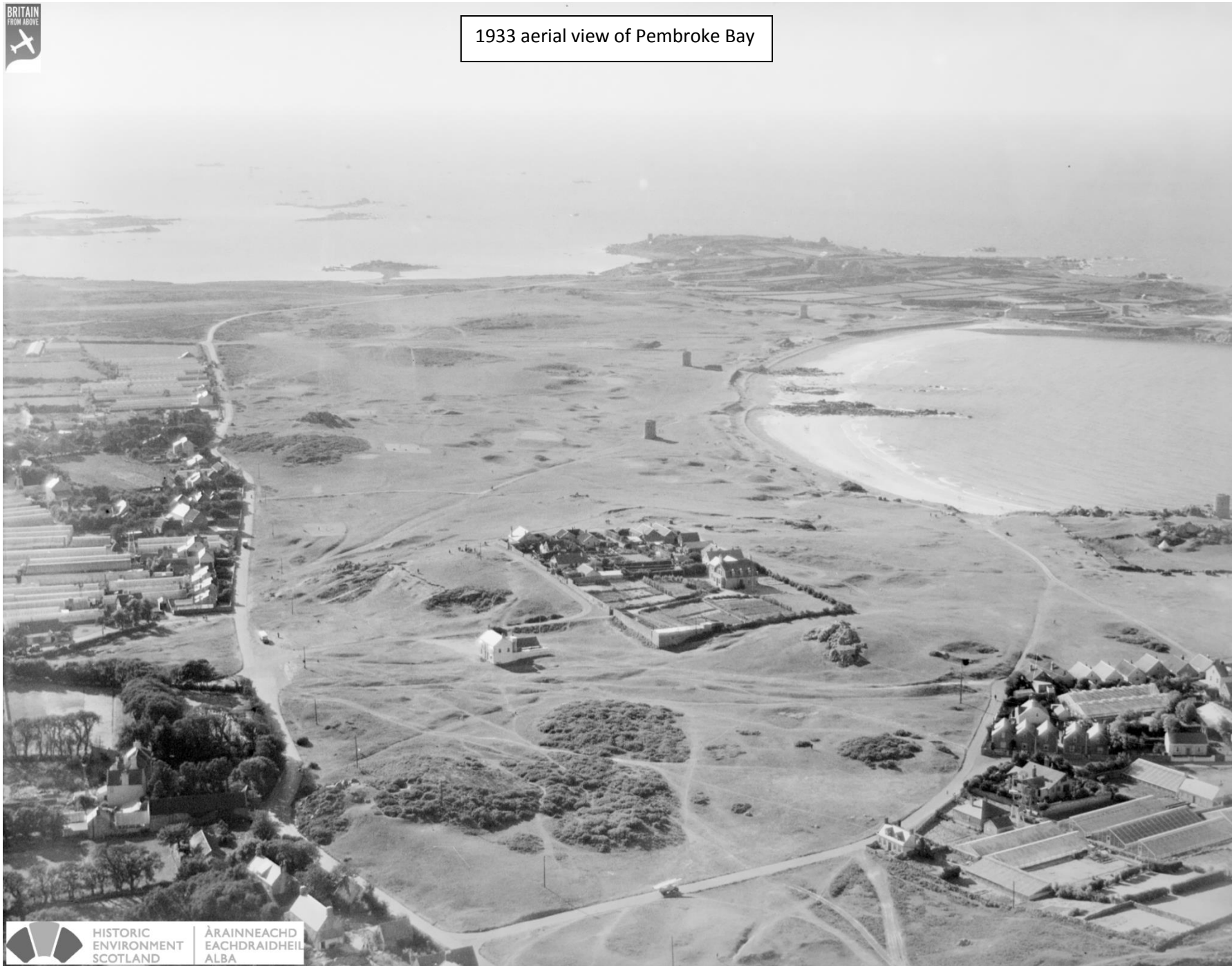
1933 aerial view of Pembroke Bay