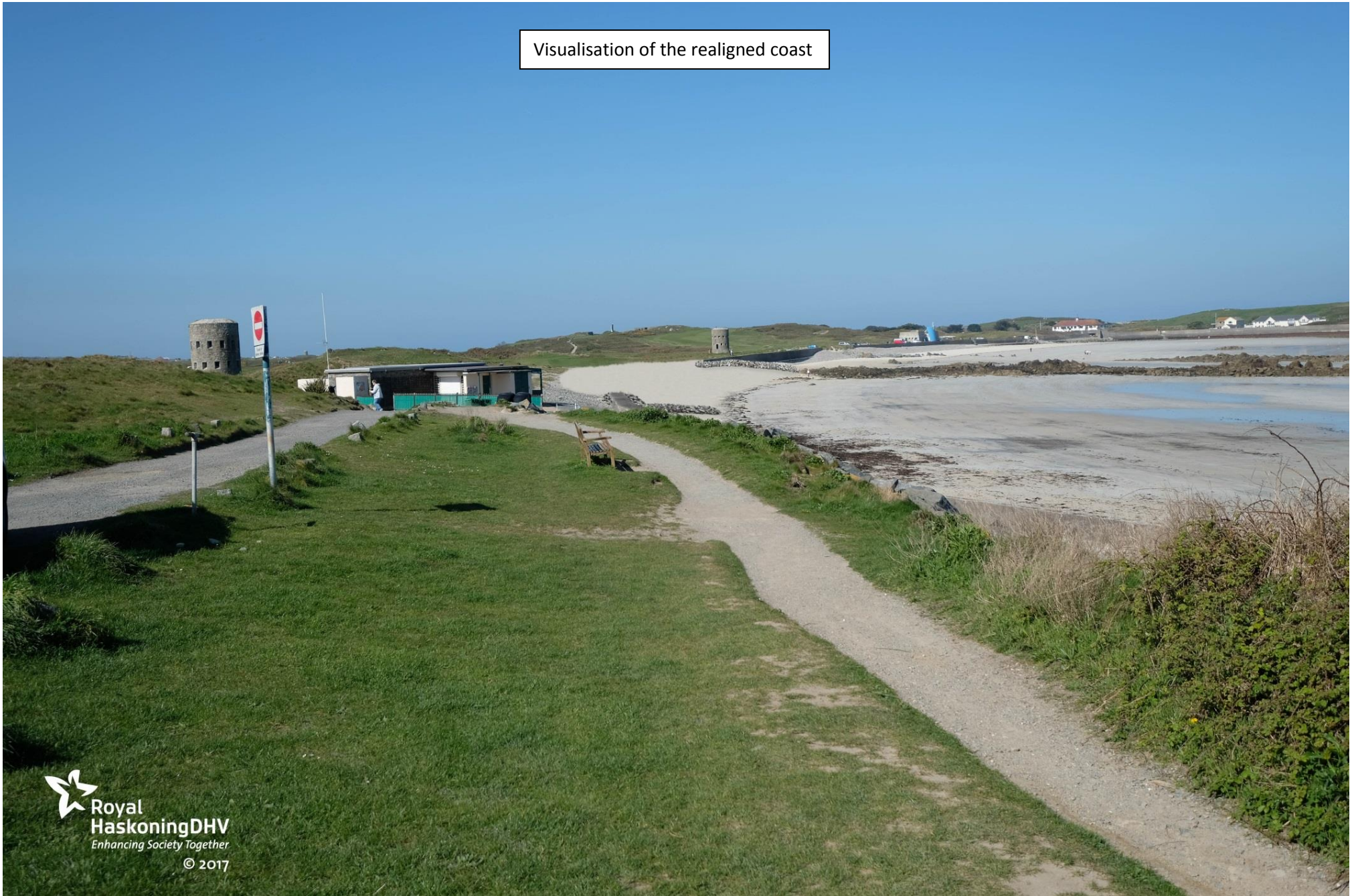
Visualisation of the realigned coast