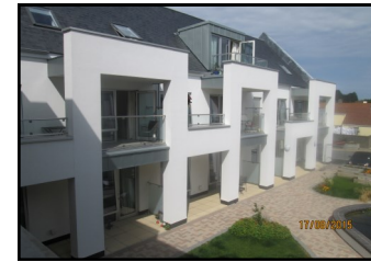
La Nouvelle Maritaine

The Extra Care housing communities at Le Grand Courtil, La Nouvelle Maritaine and Rosaire Court and Gardens provide you with the security and privacy of your own home, a range of recreational and social facilities and 24 hour care and support provision if you require it. The care and support staff at all locations are trained to meet a wide range of needs from learning disabilities, mental health problems, physical and sensory disabilities, etc.