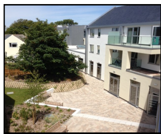
Patio Garden at Le Grand

The flats at both Le Grand Courtil, in St Martins, and La Nouvelle Maraitaine, in the Vale, are managed by the Guernsey Housing Association. The one and two bedroom flats are designed to accommodate wheel-