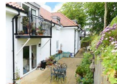
Gardens and patio area at Rosaire Court and Gardens

You may be thinking about moving because of life changes or health problems or simply because you are not happy where you currently live. You may be worried about the future of an adult