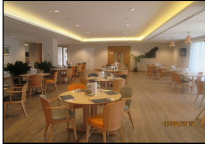
Cafe Amity at La Nouvelle Maritaine is open to the public as is Cooked at Rosaire Court and Gardens and The Magnolia Tree at Le Grand Courtil.

The biggest difference is that Extra Care Housing has on-site care and support staff on duty 24 hours a day. As well, Le Grand Courtil, La Nouvelle Maritaine and Rosaire Court and Gardens also have restaurants open to the public and a range of on-site activities and events designed to appeal to all ages. Extra care housing does not just provide an individual home, it provides a vibrant and supportive community.