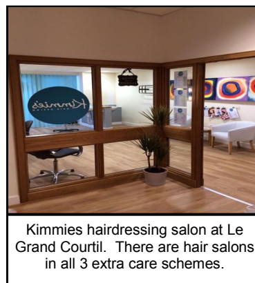
Kimmies hairdressing salon at Le Grand Courtil. There are hair salons in all 3 extra care schemes.

All tenants pay a service charge on top of their weekly rent. The Service charge covers the cost of communal cleaning, electricity, water, rubbish disposal and rates.