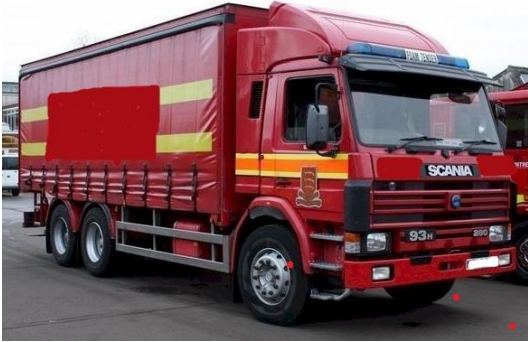
Vehicle with a sideguard

Examples of what a typical underrun and sideguards protective device look like can be found below. There are exemptions in place for agricultural vehicles/trailers and certain specialised vehicles where protective devices are impractical due to design or function of the vehicle. The design and fitting of these types of device is reasonably specialised. Owners of vehicles and trailers not fitted with them are advised to contact Traffic & Highway Services on tel. 202323 in the first instance.