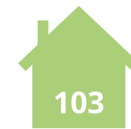
Affordable Housing Completions*

(as at end of Q4 2019) These are across 97 sites and 22 dwellings were completed in Q4 2019 alone