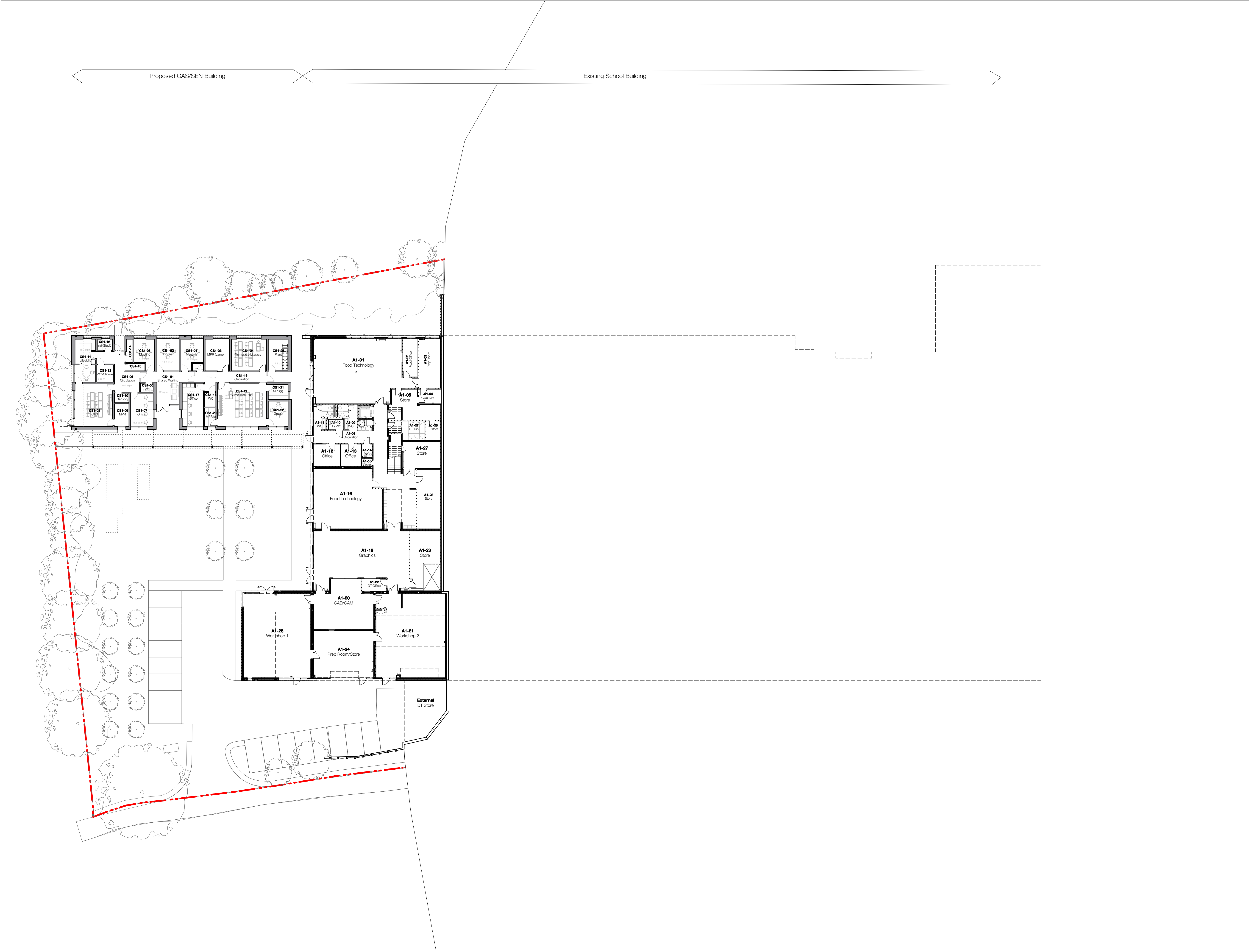
LES BEAUCAMPS HIGH SCHOOL Level 1 Proposed GA Plan