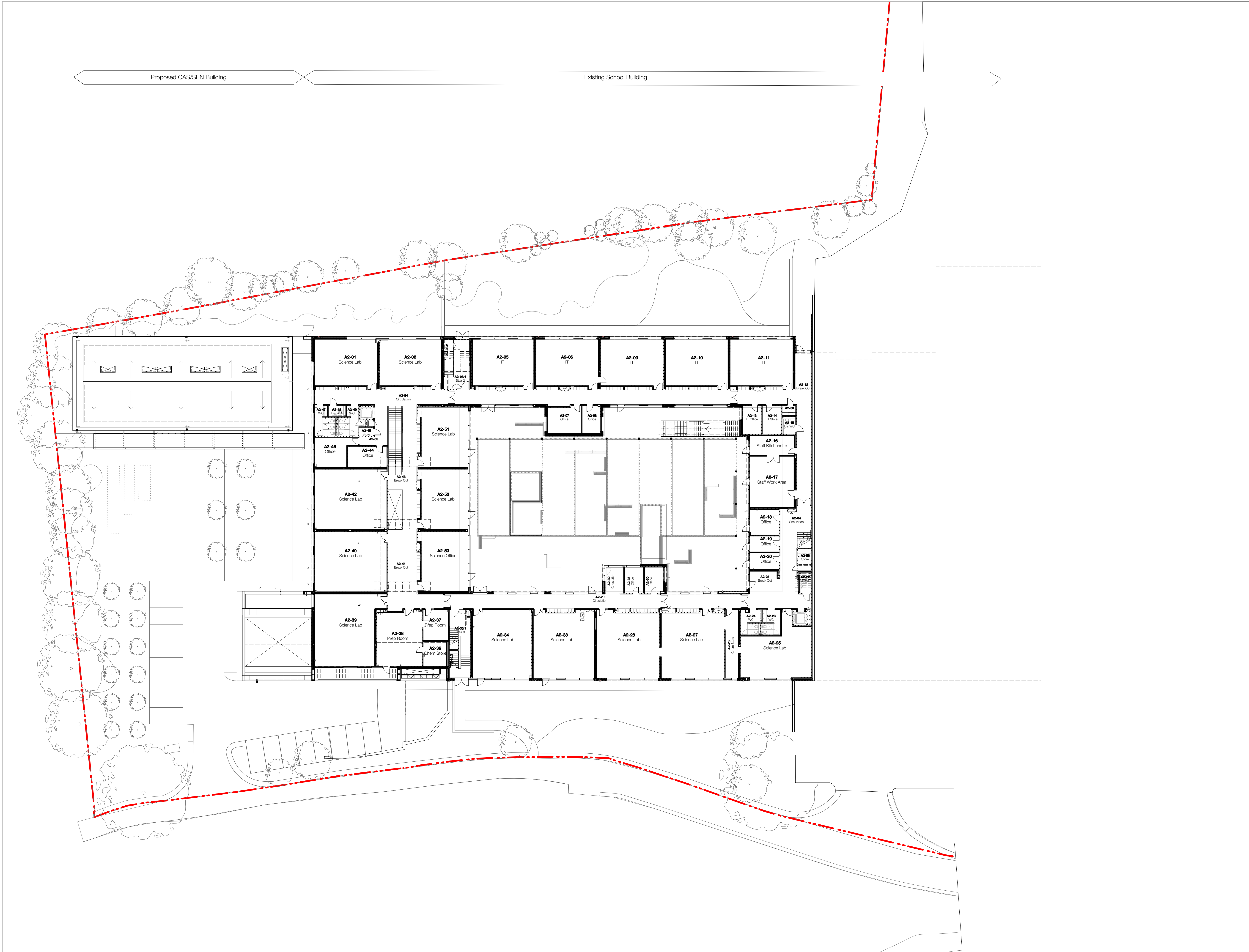
LES BEAUCAMPS HIGH SCHOOL Level 2 Proposed GA Plan