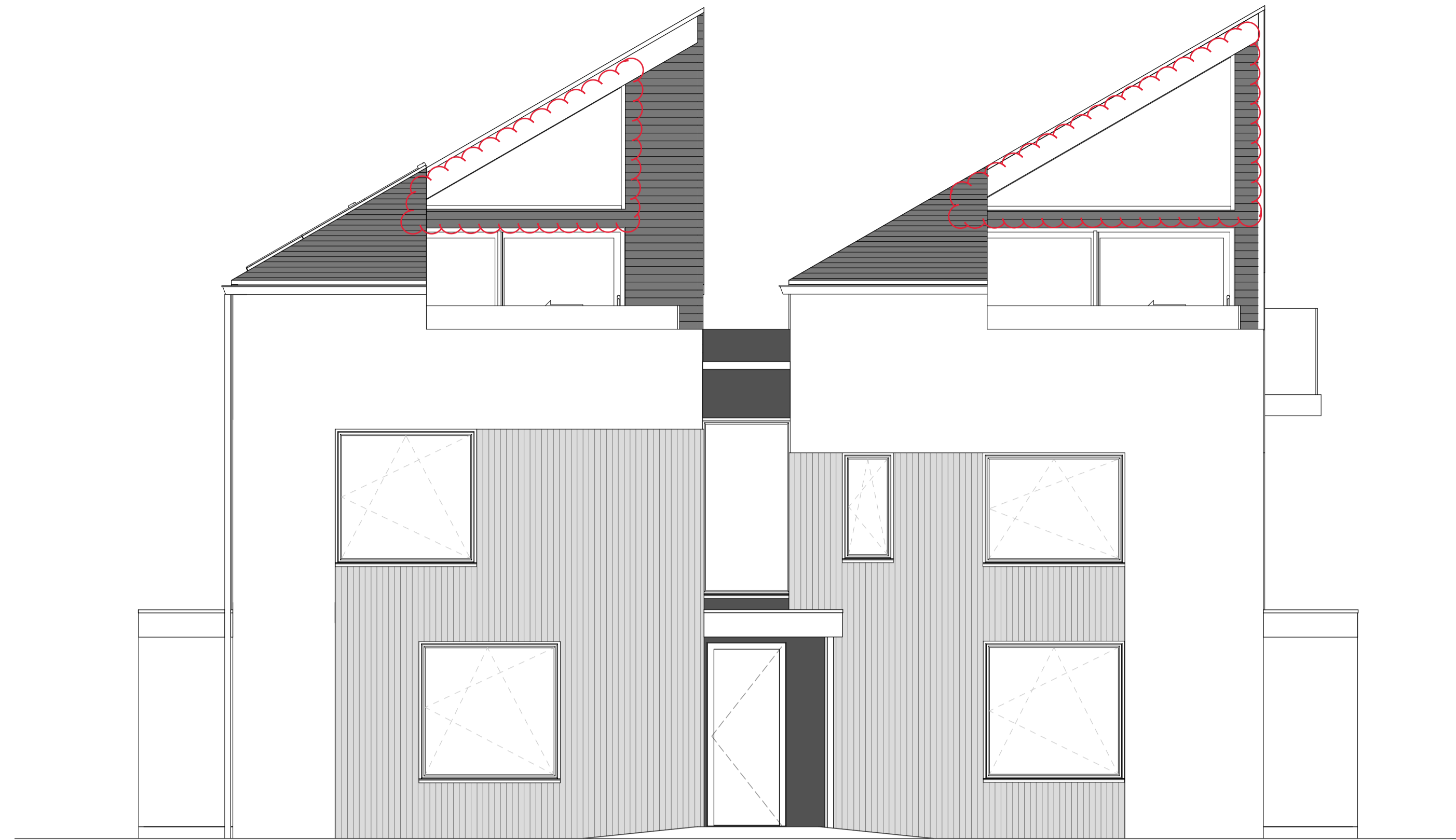
North Elevation Scale - 1 : 50