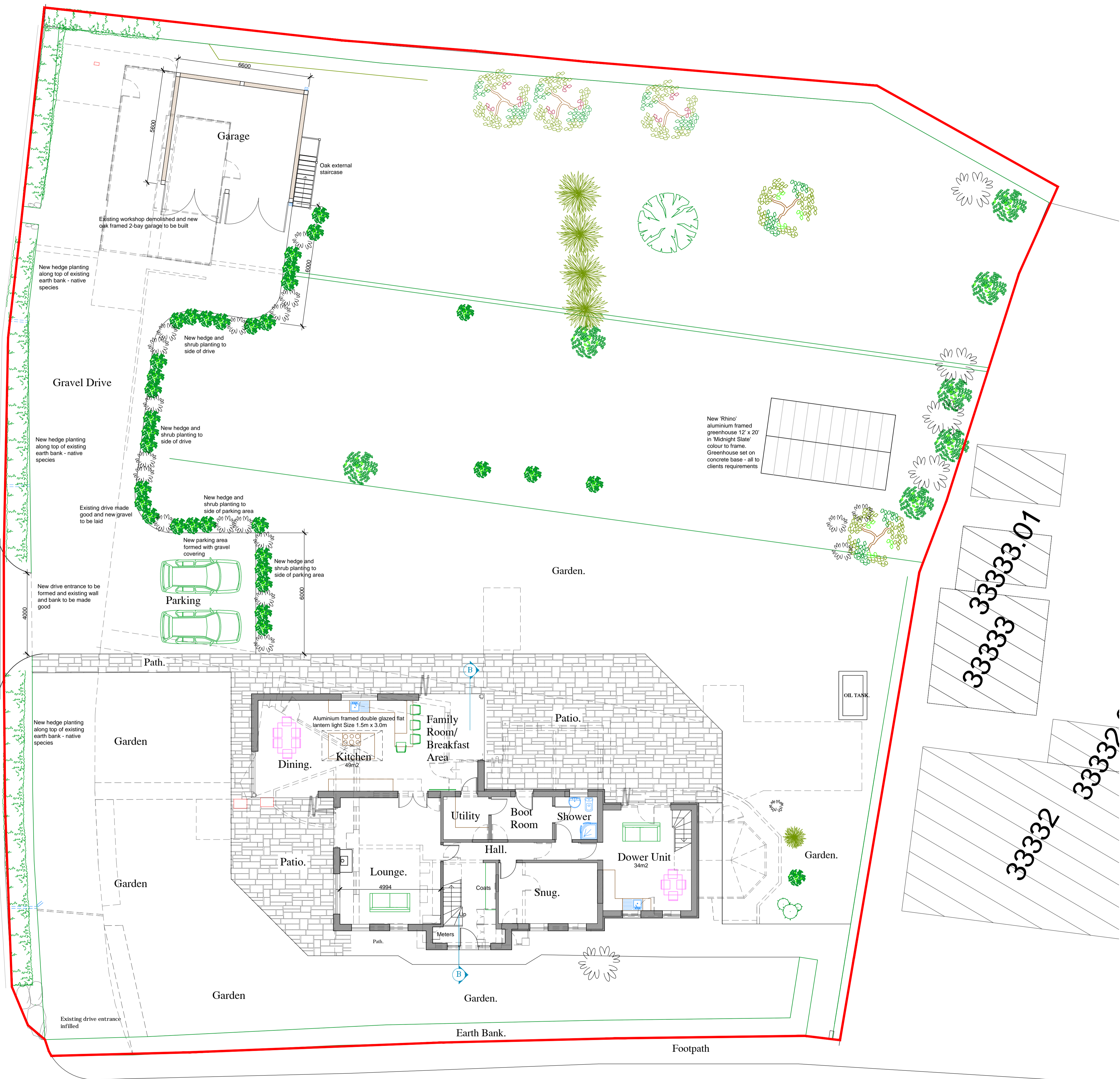
Ground Floor Plan and Site Plan. Scale - 1:100.