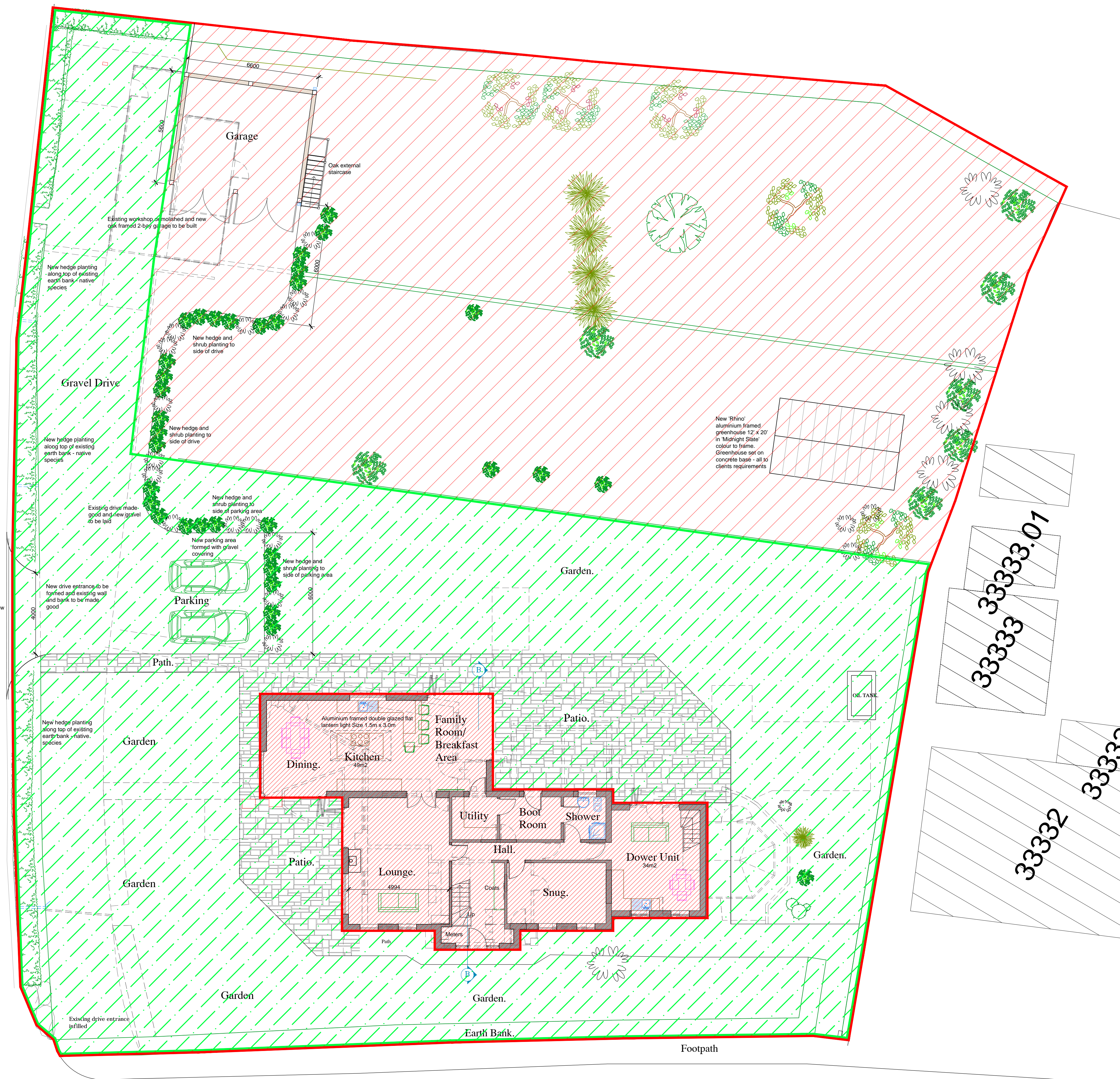
Ground Floor Plan and Site Plan. Scale - 1:100.