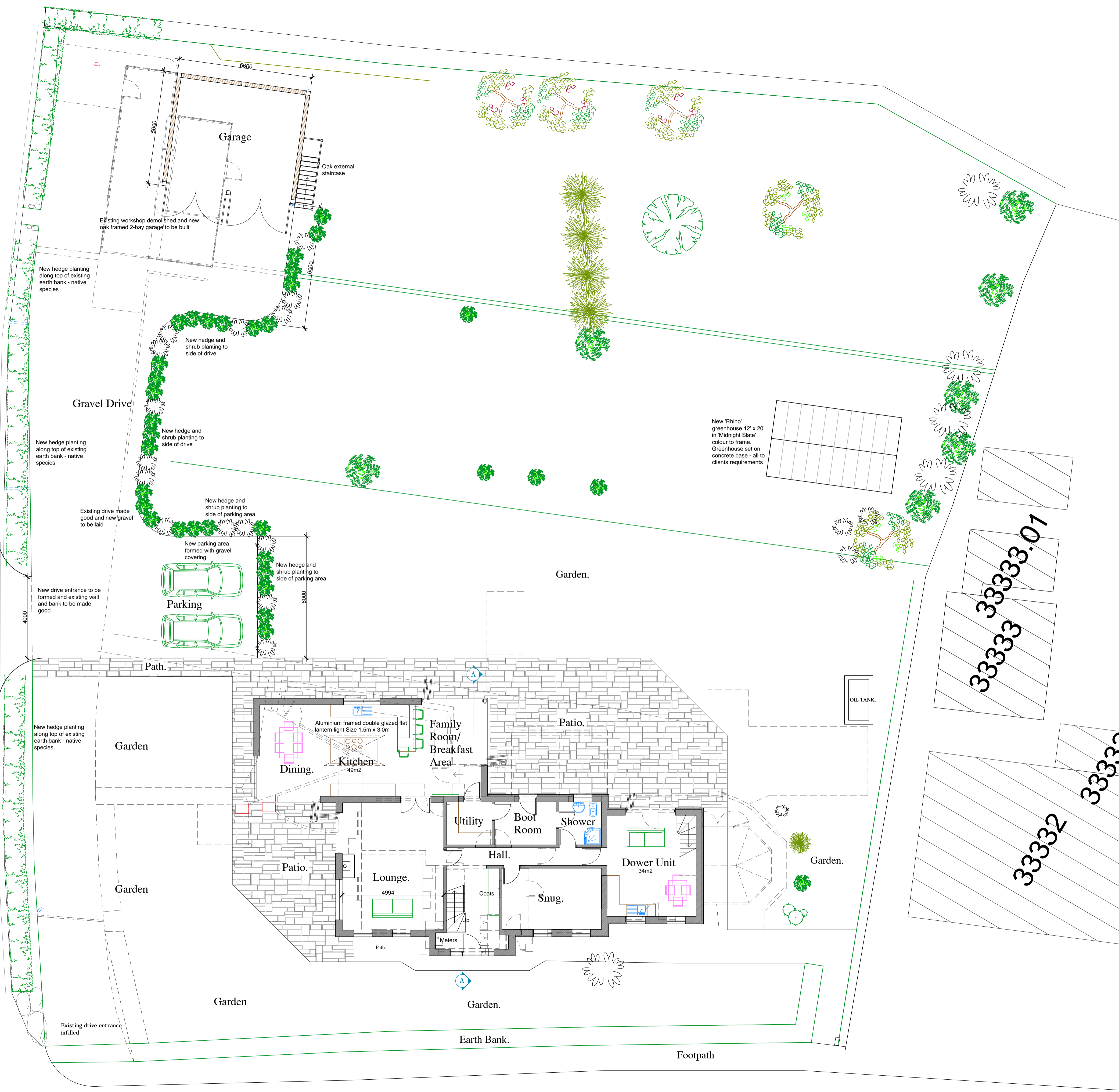
Ground Floor Plan and Site Plan. Scale - 1:100.