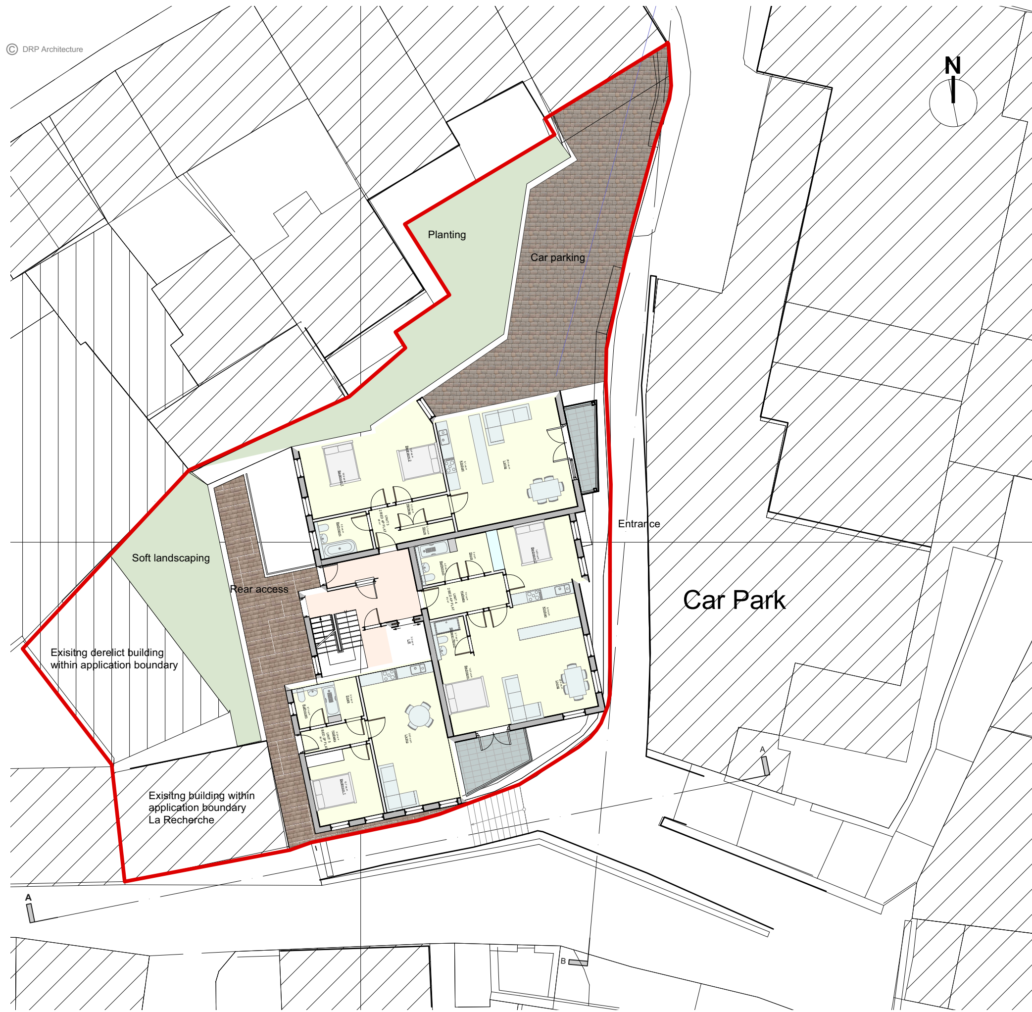
Block Plan 2-2 Scale: 1:200