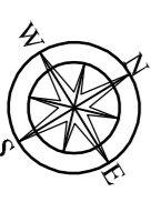
GROUND FLOOR/PART SITE PLAN 1:50