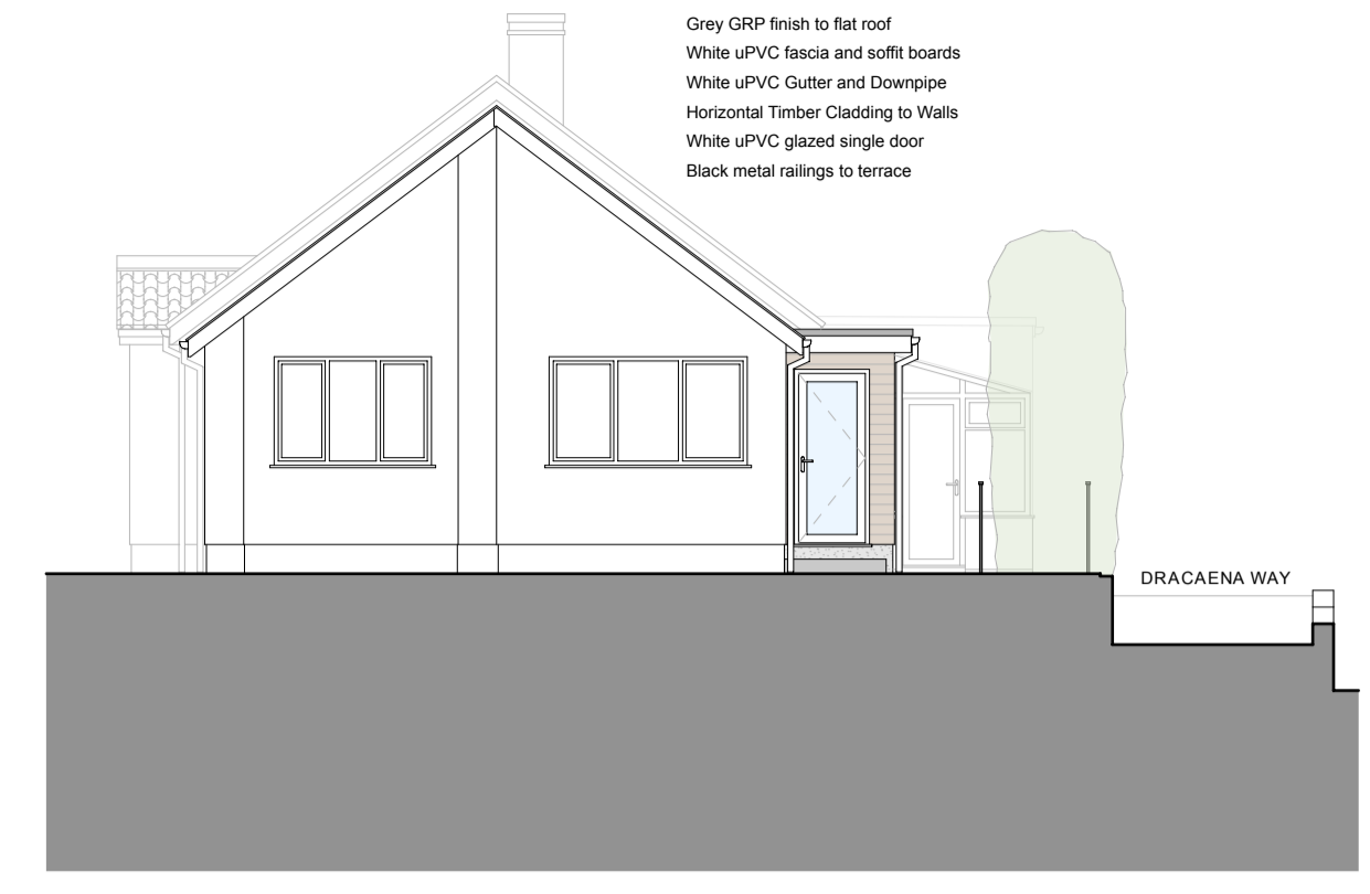
East Elevation as Proposed Scale 1:100

Copyright: This drawing is the copyright of Tyrrell Dowinton Associates Ltd and may not be reproduced without their permission in writing. Notes: It is the contractors responsibility to check all dimensions and levels on site and report all discrepancies immediately to the architect. The contractor should not scale off the drawings under any circumstance.