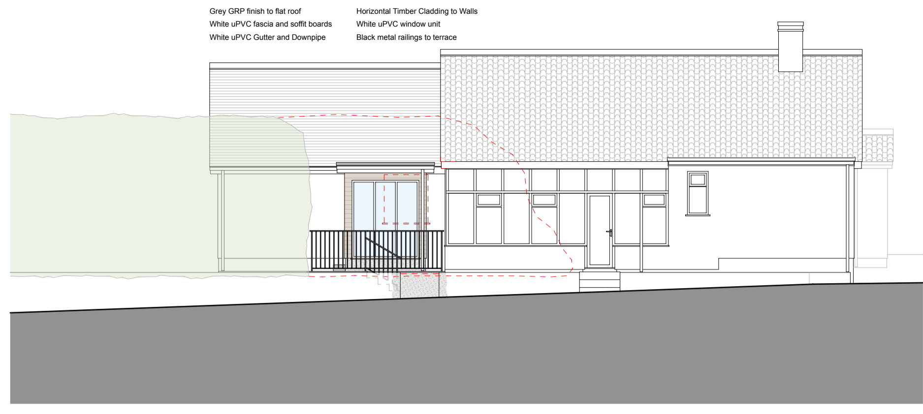
North Elevation as Proposed Scale 1:100