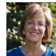
Pan Island Safeguarding Chair

I would also like to thank the ISCP Board, practitioners and managers across all agencies for their energy, hard work and continuing support to ensure we have the best possible safeguarding arrangements for children, young people, families and vulnerable adults across the Bailiwick.