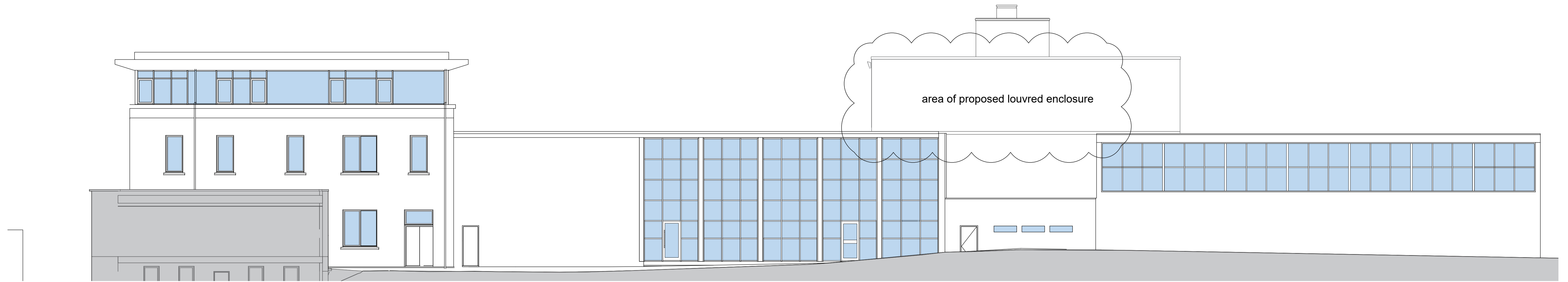
North elevation (1- 100 at A1)